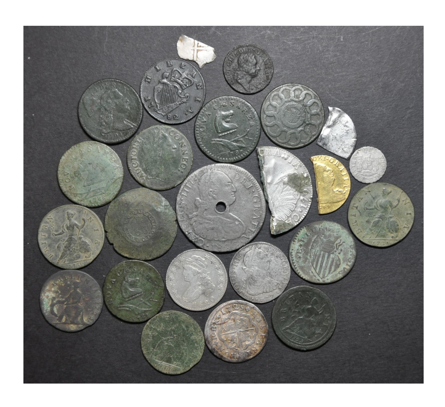
Various Colonial, Pre-Federal, Foreign & Early American Coins from the Survey